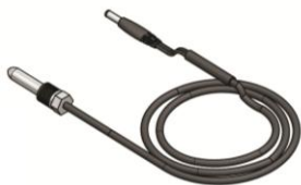
1/8 inch fine pipe thread probe with 6 foot wire that can plug into sensor.

This Stainless Steel 1/8 inch Fine Pipe Threaded Probe on a 6 foot wire allows you to just set the probe in soil, water, etc. for measurement or secure the probe wire through a hole with the 1/8 inch Fine Pipe Thread, to prevent movement.