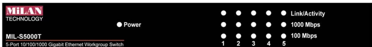
Figure 2-1. Front Panel view of the MIL-S5000T Gigabit Ethernet Switch

The front panel of the Gigabit Ethernet Switch consists of LED Indicators, which display the conditions of the Gigabit Ethernet Switch and the status of the network.