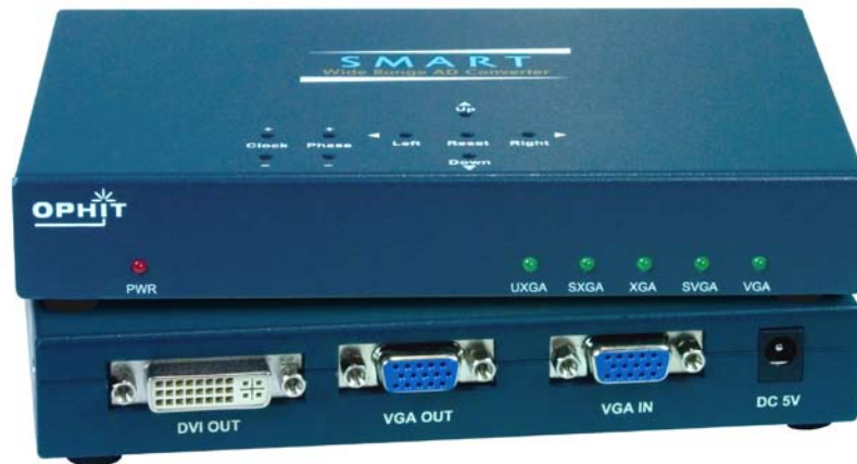
VGA-DVI (Front and Back)

Converts analog VGA signal to digital DVI-D video