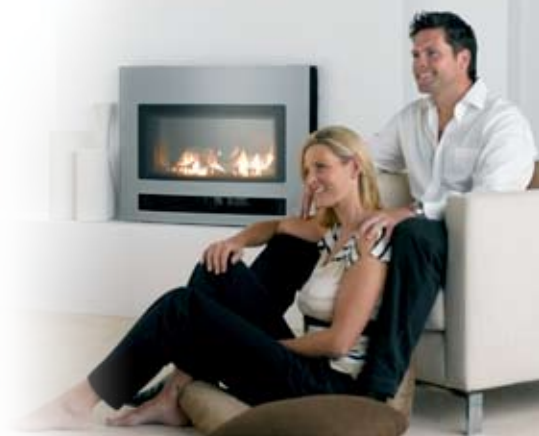
FIREPLACE SHOWN WITH SILVER RADIUS GLASS FRONT