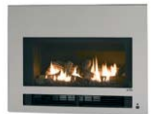
STREAMLINE STAINLESS STEEL METAL FRONT