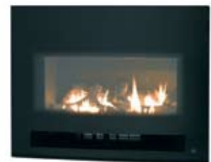
BLACK RADIUS GLASS FRONT