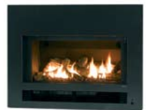
STREAMLINE BLACK METAL FRONT