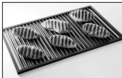
Grilling Grate SH-26731