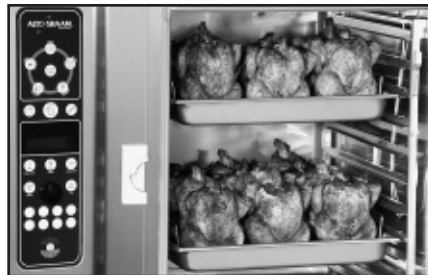
Six Chicken Roasting Rack (pan not included) SH-23000