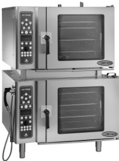
Model 7•14ES over Model 7•14ES