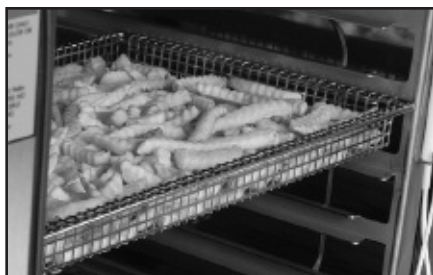
Fry Basket BS-26730