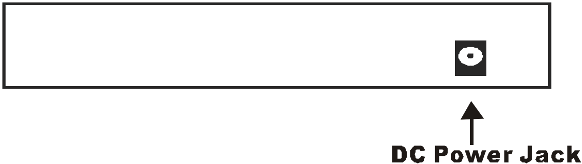
Rear panel view of the 8-port 10/100/1000Mbps Gigabit Ethernet Switch

The rear panel of the Switch consists of an DC power connector. The following figure shows the rear panel of the Switch.